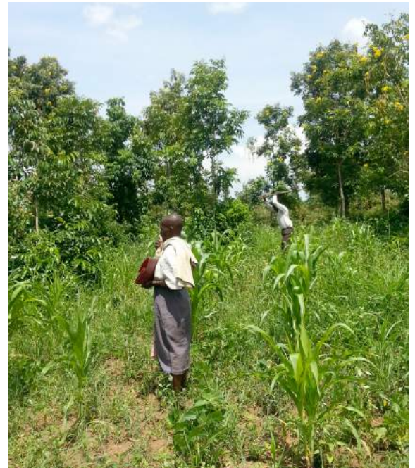
Maize farmer in East Africa

First and foremost, this approach should reduce the human development losses that occur during periods of drought and other types of climatic stress that reduce incomes for both farm and landless labor families. Second, stress-resistant technologies pay a further “risk-reduction dividend,” inducing behavioral change on the part of producers who intensify production, raising incomes and food availability levels in average, non-stress years. It is the goal of this study to determine if stress-resistant technologies are a cost-effective approach to meeting nutrition and health goals.